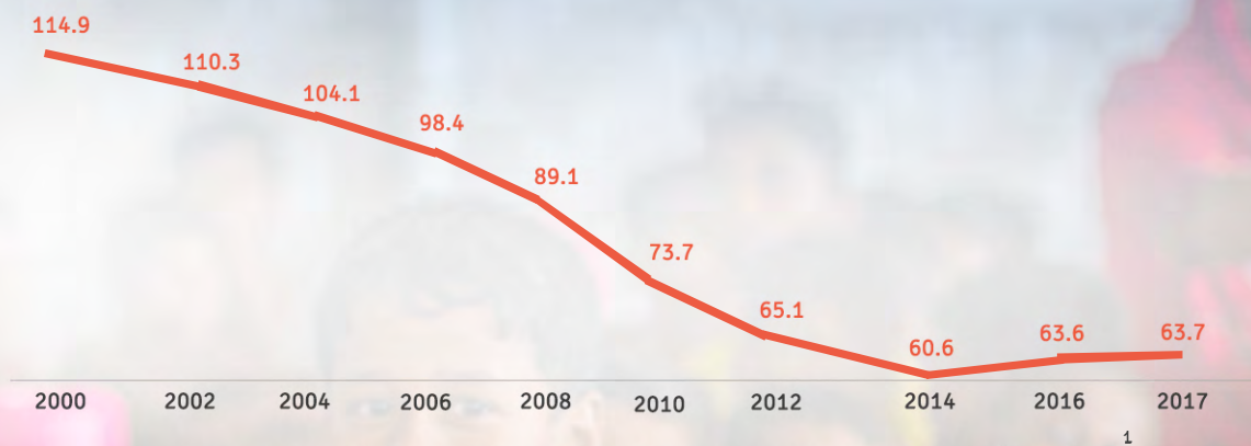
Figure 1: Number of undernourished people in Southeast Asia (millions) 1

Breadth: The number of undernourished people in Southeast Asia was on a consistent decline from 2000 to 2014, but started to increase by 3 million in 2016. (Figure 1).