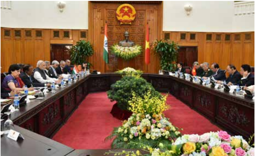
Indian Prime Minister Narendra Modi (third from left) and the Prime Minister of Vietnam, Mr Nguyen Xuan Phuc (second from right) at the delegation-level talks at the Presidential Place in Hanoi in September 2016

In the South China Sea and the Eastern Pacific, India is gradually treating Vietnam just as China views Pakistan in South Asia: as a source of strategic heft. Indian strategists have long suggested that New Delhi should leverage Vietnam's conflicts with Beijing to its advantage. Ever since the two countries signed a Joint Declaration on Strategic Partnership in November 2007, raising their bilateral relationship to a strategic partnership, India-Vietnam security cooperation has accelerated.