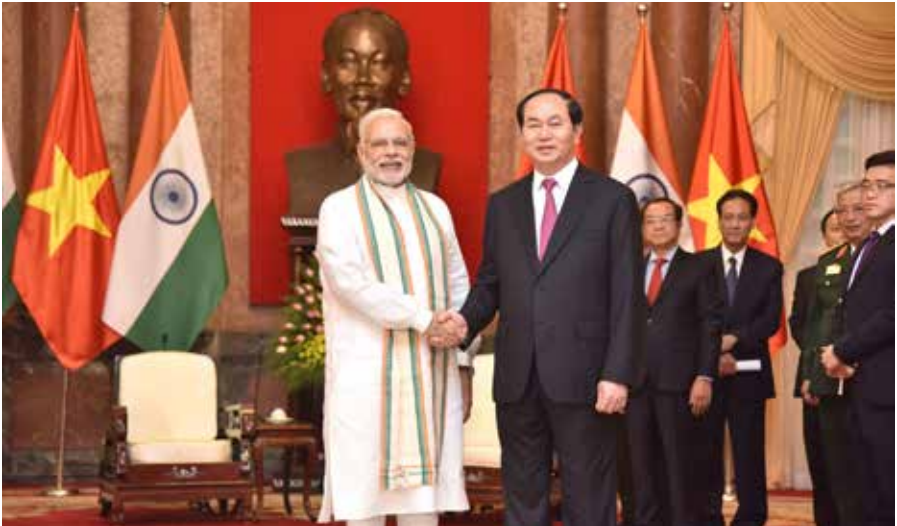
Prime Minister of India, Narendra Modi, meeting the President of Vietnam, Mr Tran Dai Quang, in Hanoi, Vietnam on September 03, 2016

Indian Prime Minister Narendra Modi visited Vietnam in 2016, on his way to China for the G-20 summit. The visit, the first by an Indian prime minister in 15 years, made it clear that New Delhi was no longer hesitant to expand its presence in China’s periphery. The Modi government has made no secret of its desire to play a more assertive role in the Indo-Pacific region. Modi himself has argued that India can be an anchor for peace, prosperity, and stability in Asia and Africa. A more ambitious outreach to Vietnam, therefore, should not be surprising.