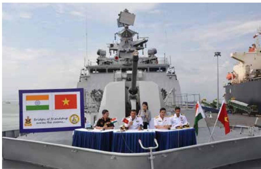
Officers at a media conference onboard the warship INS Sahyadri in Da Nang, Vietnam, during a visit in October 2015

Maritime cooperation between Vietnam and India remains the focus, with Vietnam giving India the right to use its port in Nha Trang, situated close to the strategically significant Cam Ranh Bay. The Indian Navy has been making regular visits to this southern Vietnamese port. Vietnam has even asked India to develop this naval facility. The fact that not even the US, a close ally of Vietnam in the region, has been conferred this privilege underscores Vietnam's perceptions about the imperative of defence cooperation with India. Since 2011, Hanoi has been insisting that New Delhi train its sailors in submarine combat and its pilots in flying the Sukhoi 30 aircraft, and transfer medium-sized naval warships and cruise missiles. India has responded positively. The Indian Navy now trains around 500 Vietnamese sailors in comprehensive under-water combat at its submarine facility, INS Satavaham, while its Air Force offers pilot conversion training to the Vietnamese Air Force.