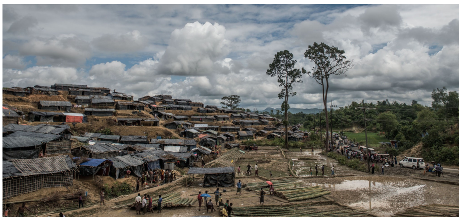
Rohingya refugees in Kutupalong Makeshift Camp, in Ukhiya, Bangladesh, September 2017. To date, more than 500,000 Rohingya people are estimated to have fled to Bangladesh from neighbouring Rakhine state, Myanmar