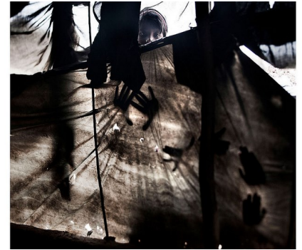
A child in the Kutupalong Markeshift Camp in Ukhiya, Bangladesh, in August 2009. Some Rohingya have been displaced in Bangladesh since the 1990s. Their children have grown up in camps there.

together. In other words, there may be both threats and opportunities for proponents of the human security concept.