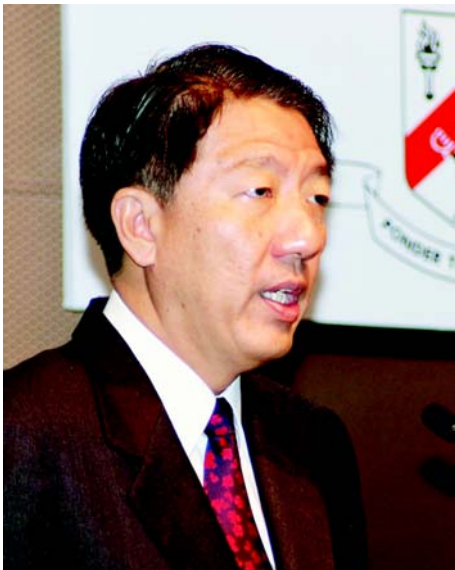
Defence Minister Teo Chee Hean opening the 7 th APPSMO on 4 August 2005.

S ingapore's Defence Minister Teo Chee Hean advocated cooperation among governments and security forces in this increasingly interconnected and interdependent world.