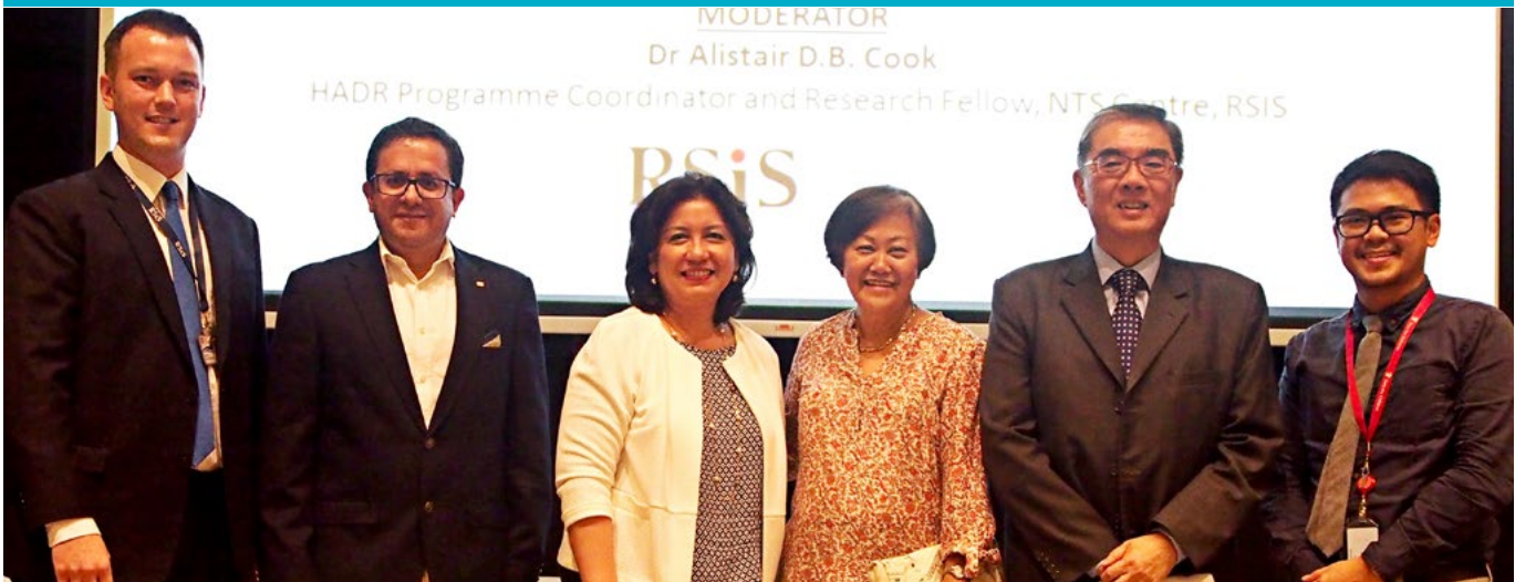
Group photo taken at the World Humanitarian Day Event