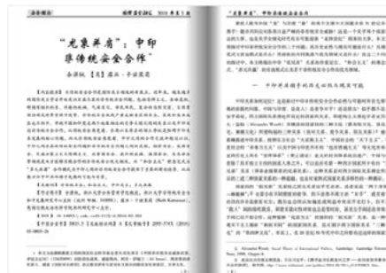
The paper: "Dragon and Elephant, Shoulder to Shoulder": Non-traditional Security Cooperation Between China and India.