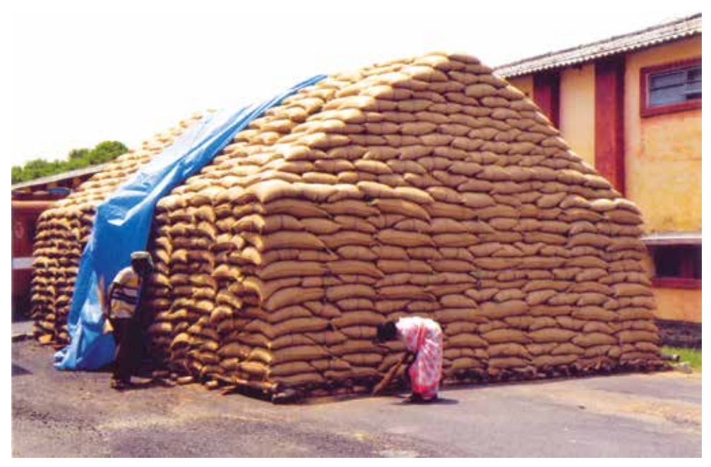
Food Corporation India

Public stockpiling is also considered a strategy for domestic food security and as an alternative to tradebased policies for food. However, there are spill-over effects of adopting such policies internationally. In the case of thinly traded commodities such as rice, should most countries strongly adopt such policies, there is likely to be fewer stocks available globally for exports, potentially leading to limited supply and higher prices.4 Widespread adoption of stockpiling practices would therefore have the opposite effect to their intended outcomes and exacerbate volatilities in food supply and price. Since 2013, major discussions and disputes in the World Trade Organization (WTO) have centred on the issue of national stockpiling for food security and its acceptability in the global trade regime. A provision allowing public stockpiling for food security purposes has been accepted for the time being. This acceptance, although provisional and supposedly temporary, has made stockpiling an even more popular policy option for governments in order to ensure better food security for their populations.5