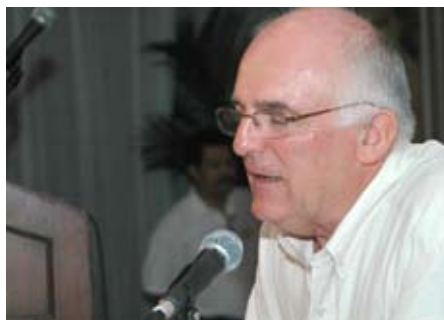
Sir Richard Dearlove speaking at the Singapore Technologies Engineering Distinguished Dinner Lecture.

With a persona that could be described as charismatic and perhaps even candid, the veteran of close to 40 years of intelligence experience began his speech in a light-hearted fashion, occasionally displaying flashes of wit and humour that captivated his audience. That, however, did not detract from the salience of the topic. In his lecture, Sir Richard inferred several complications emanating from various global incidents (such as the invasion of Iraq as well as the ongoing Israel-Hezbollah conflict in Lebanon) as reverberations of the September 11 attacks. These complications highlight the complex interplay among different aspects of the security problem that intelligence officers and policy-makers are facing today. In particular, the 61-year old alerted all to the dynamic evolution of the terrorist threat in which its global nature has significantly transformed the role of security and intelligence today. Hence, in order to develop a successful security and intelligence community, one must always be adaptive to geopolitical and cultural mutations by