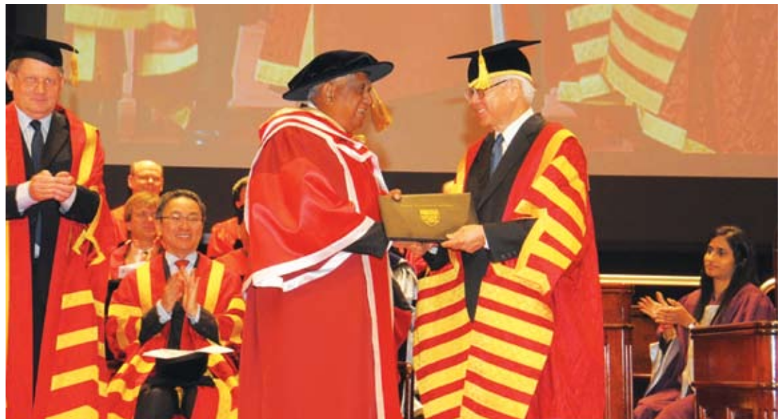
Mr Nathan (left) receiving his honorary doctorate from President Tony Tan

From a school dropout to a Doctor of Letters...that is the remarkable if unexpected journey of S. R. Nathan, former President of Singapore (1999-2011).