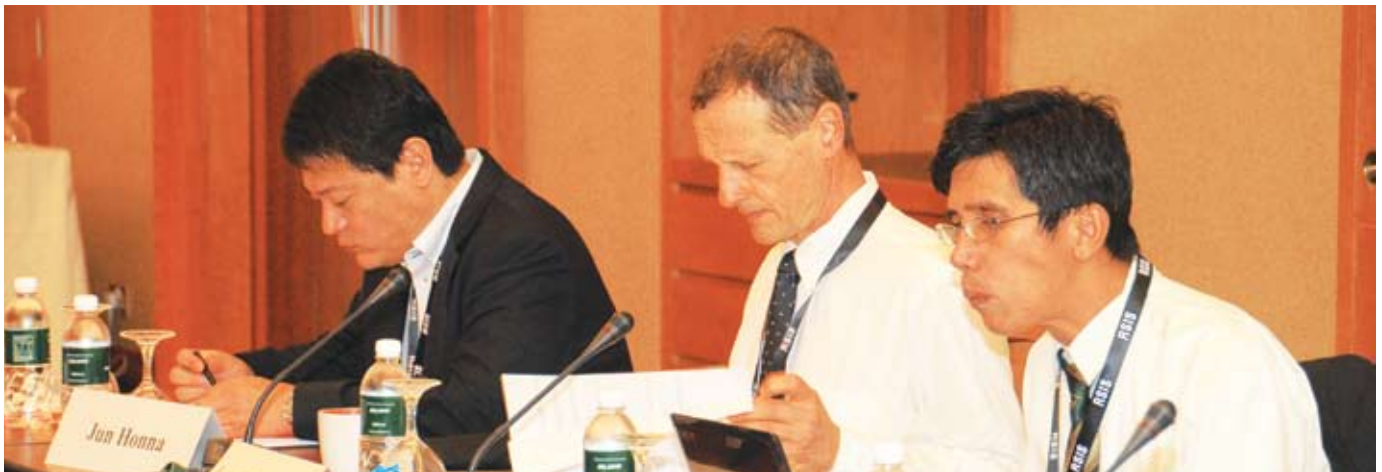
Participants at the Workshop

The proceedings and discussions in the workshop will be published in an edited volume by the Indonesia Programme.