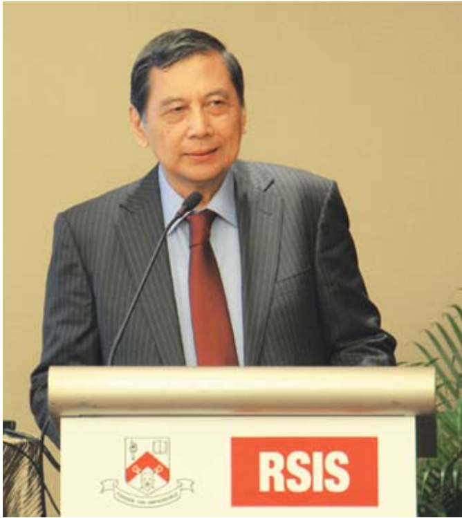
Prof Juwono Sudarsono

T he Indonesia Programme at RSIS brought together a number of distinguished scholars and military observers to discuss the various aspects of Indonesia's military transformation in a workshop in Singapore, on 24-25 November 2011. In his keynote address at the opening session, Prof Juwono Sudarsono, a former Minister for Defence, highlighted the "minimum essential forces" as the departing point of military transformation in Indonesia.