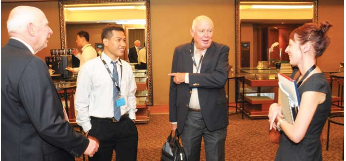
Speakers and participants networking during the break

R ISIS held a joint conference with the Center for Naval Analyses (CNA) on 9-10 November 2011. Entitled “Navigating the Indo-Pacific Arc,” the conference touched upon maritime strategic issues in the Indo-Pacific region, particularly on maritime flashpoints and the interaction between major powers in the region.