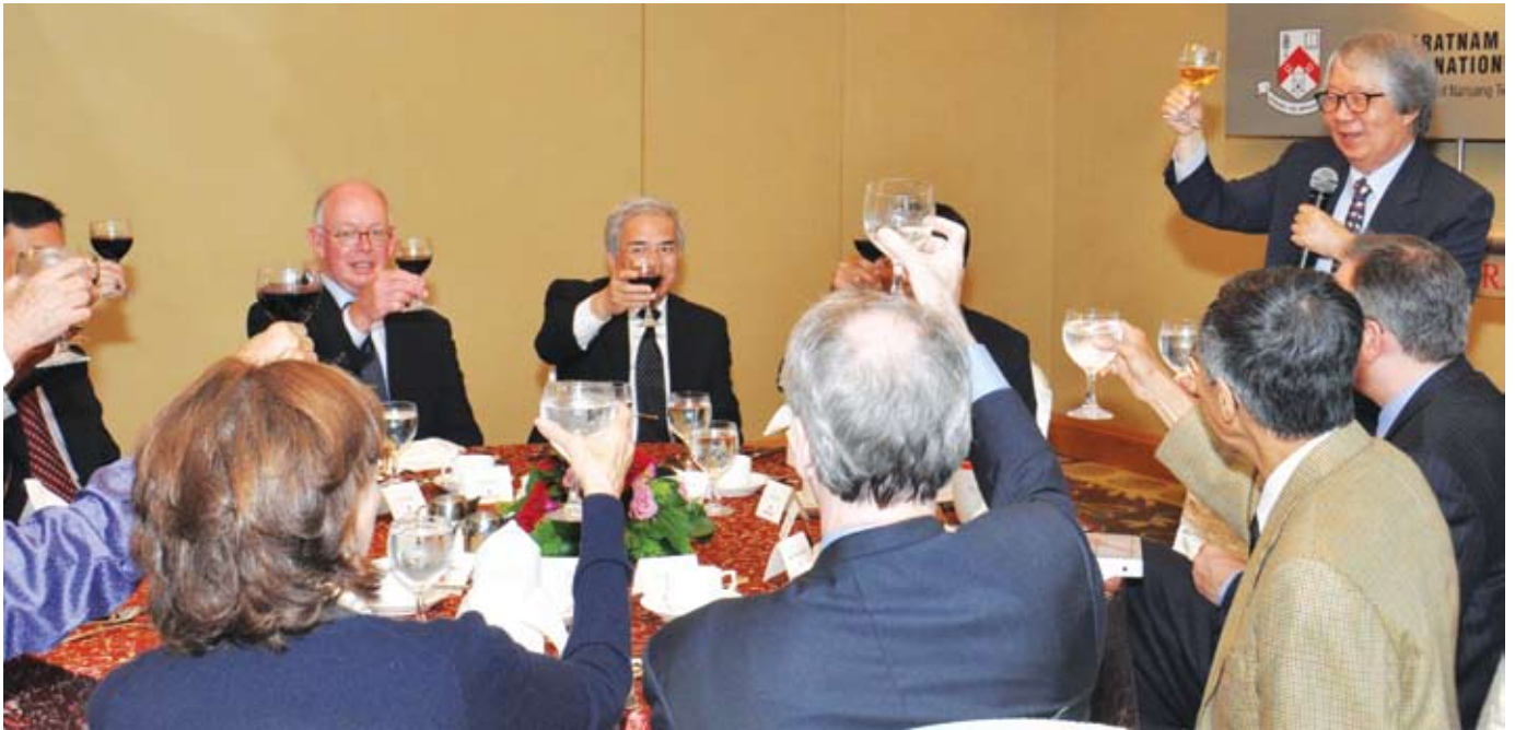
Professor Tommy Koh (standing) toasting speakers and participants at the Welcome Dinner

R SIS and Ritsumeikan Asia Pacific University (APU) jointly organised a conference entitled “Engaging the United States: Asia Pacific Responses” in Singapore on 2 Dec 2011.