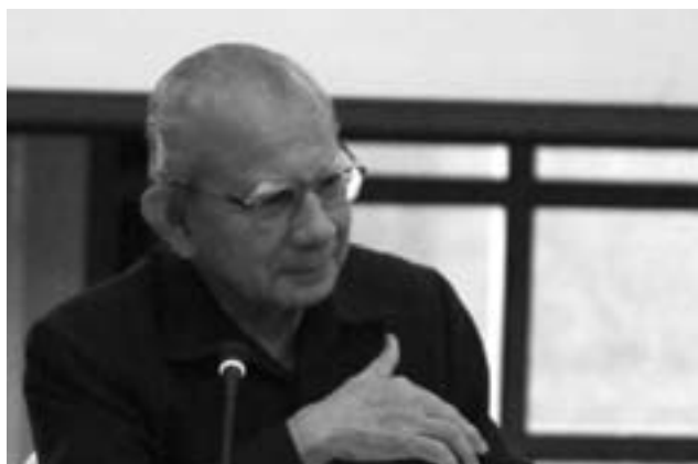
Prof. Emil Salim

Finally, it was argued that the issues and challenges of climate change call for greater cooperation and partnership amongst the riparian countries. However, in view of different states’ interests and the different degrees of vulnerabilities, it was proposed that a new form of governance is needed, one which is multi-layered and multi-level, and includes different state and non-state actors within one institution. The appeal of such an institution is that it is inclusive and promotes cooperation rather than competition, while simultaneously taking into account the intricacies of member states and greater participation of non-state actors.